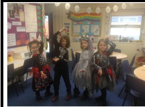
Celebrating Dia de los Muertos