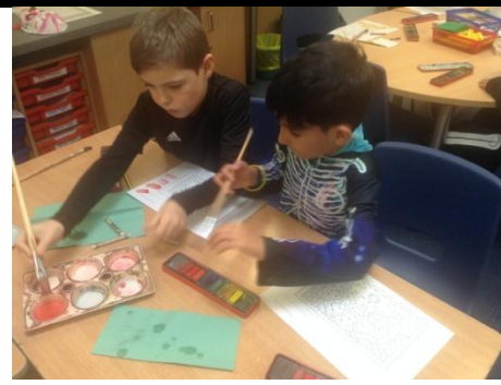
Mexican Papel Picado decorations